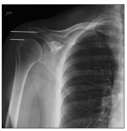
Figure: Acromiohumeral distances were measured with conventional radiography. Measurements were performed from the dense cortical bone of the undersurface of the acromion to the greater tuberosity of the humeral head preoperatively.

The authors have no relevant financial relationships to disclose.